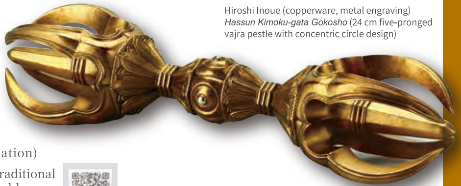
Hiroshi Inoue (copperware, metal engraving) Hassun Kimoku-gata Gokosho (24 cm five-pronged vajra pestle with concentric circle design)

Takaoka Takumikai website (Japanese language only)